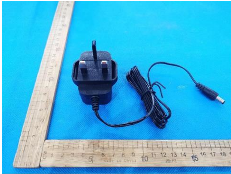
Figure 3: Outlook view of LED driver For M240100-A033BS