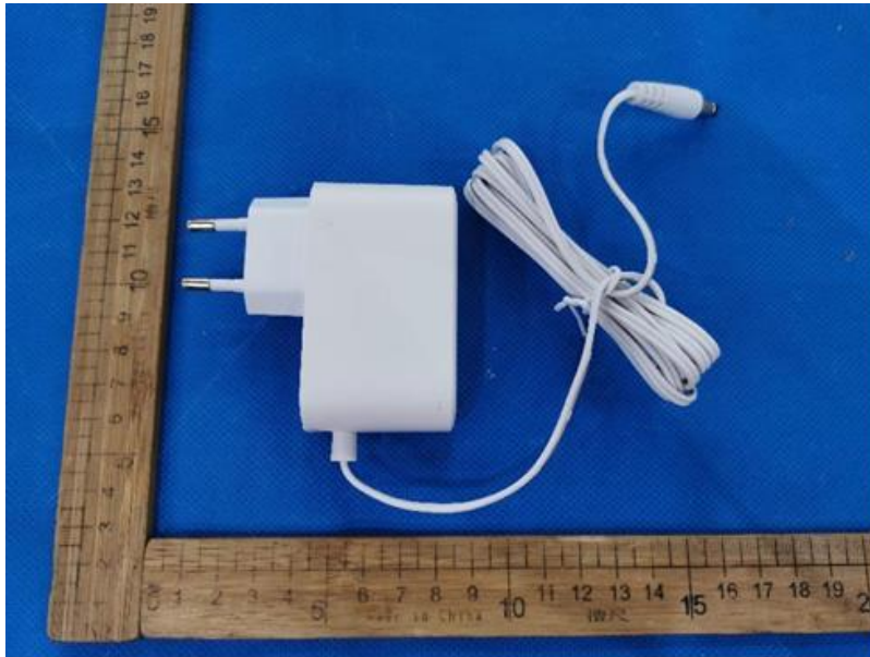
Figure 5: Outlook view of LED driver For M240100-A036EU