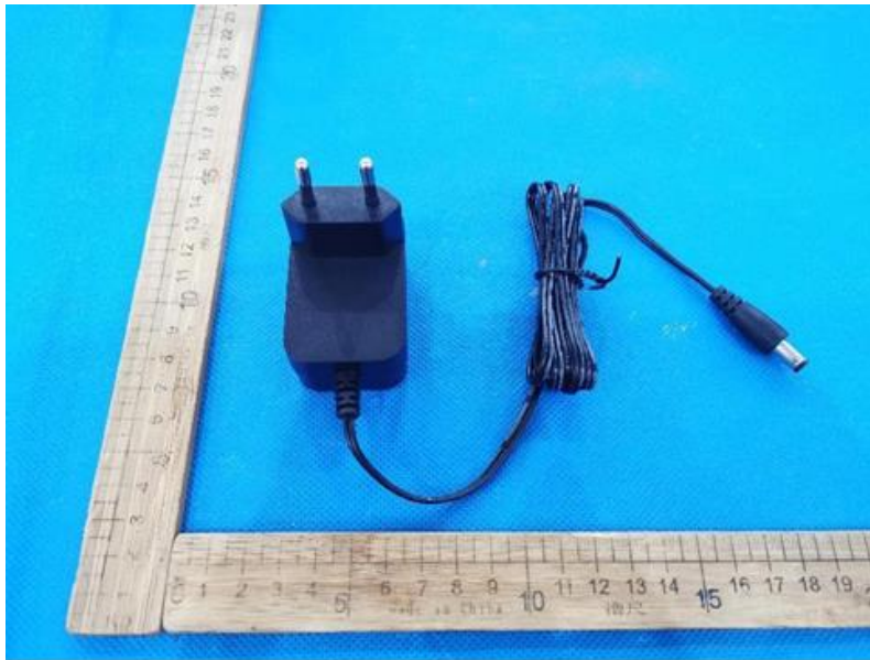
Figure 1: Outlook view of LED driver For M240100-A033EU