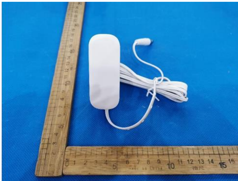
Figure 6: Outlook view of LED driver For M240100-A036EU