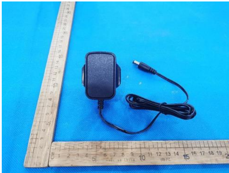
Figure 4: Outlook view of LED driver For M240100-A033BS