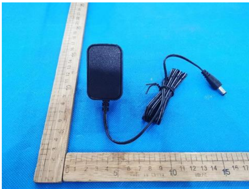
Figure 2: Outlook view of LED driver For M240100-A033EU